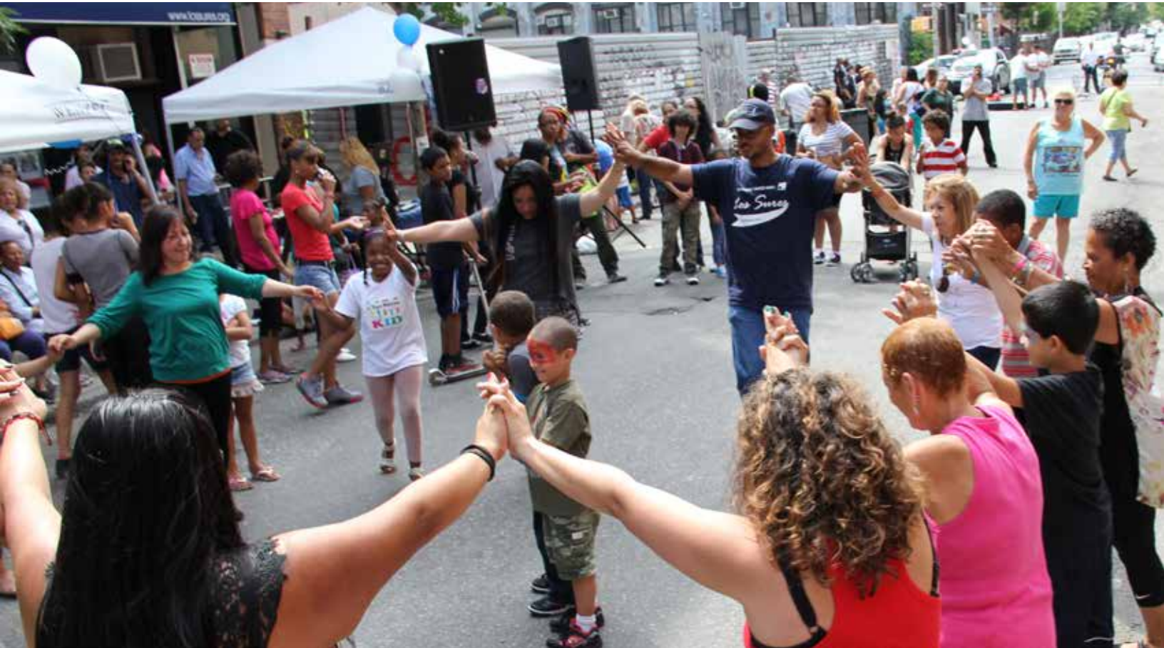
Community Residents at the South 5th Street Block Association Block Party, facilitated by Los Sures.