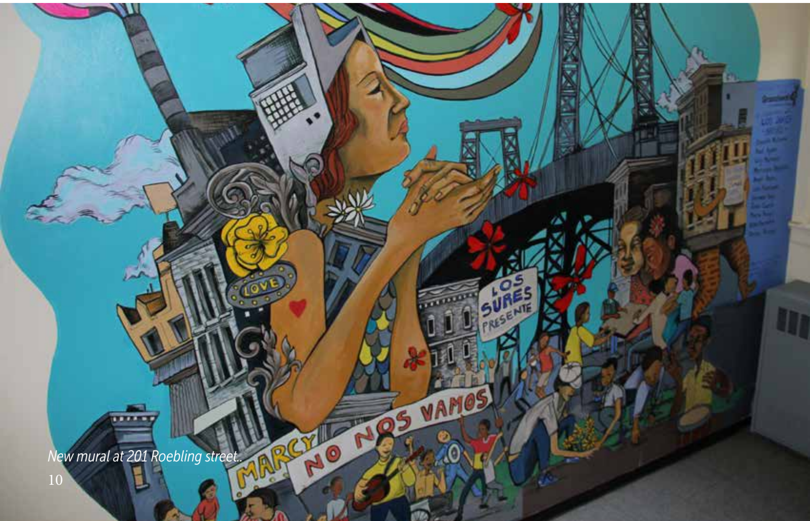
New mural at 201 Roebing street.