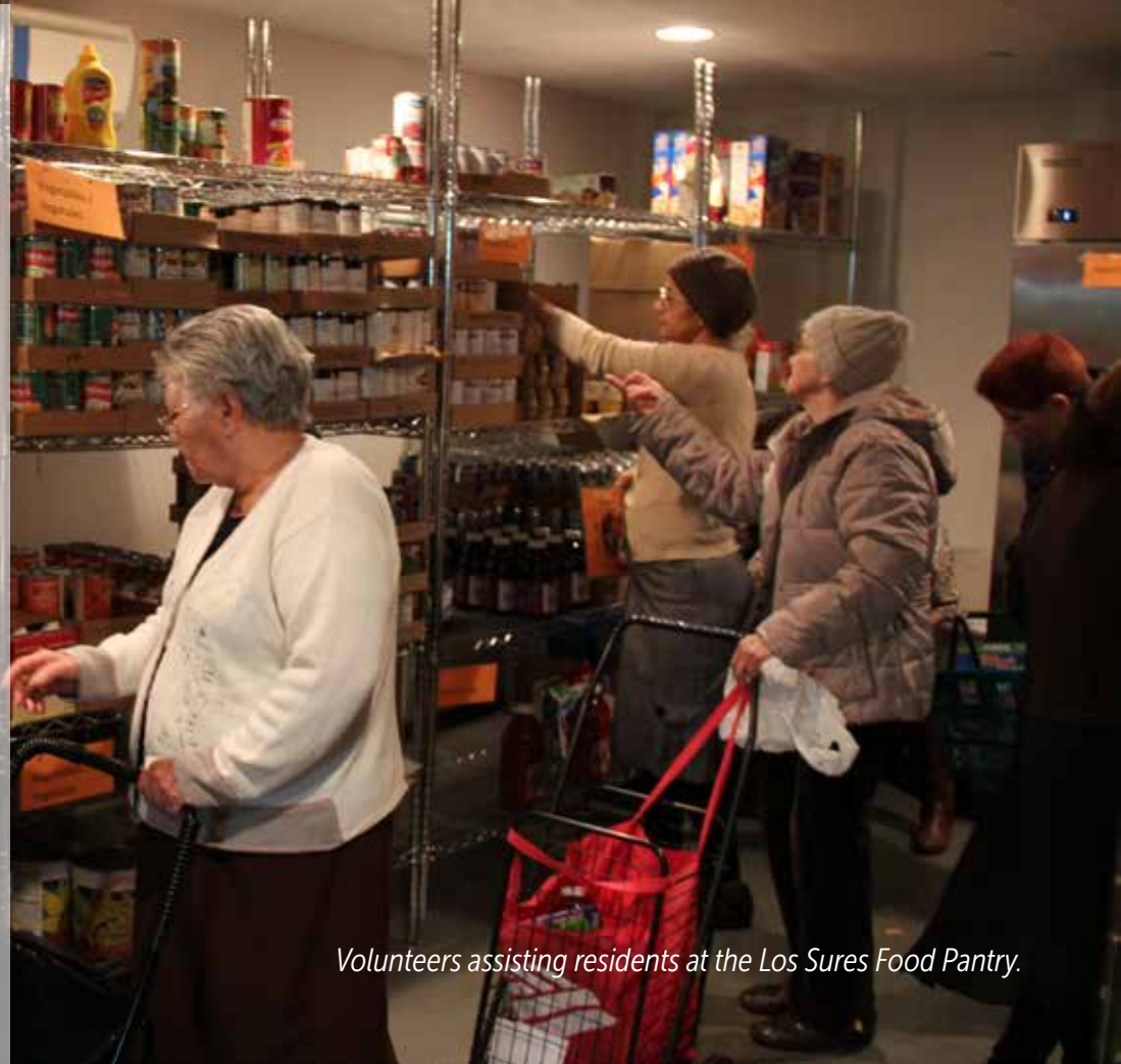
Volunteers assisting residents at the Los Sures Food Pantry.