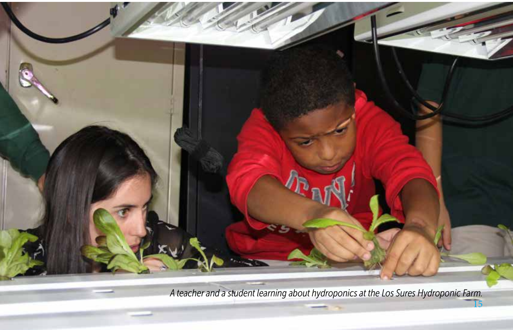
A teacher and a student learning about hydroponics at the Los Sures Hydroponic Farm.