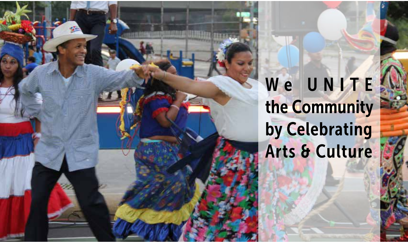
Cultural dance performance at 2014 Dominican Restoration Day.