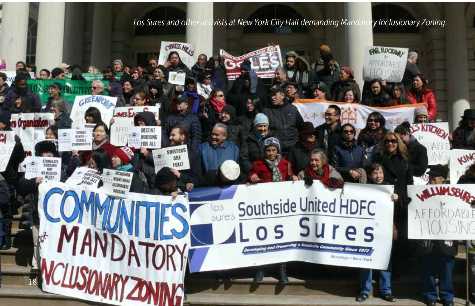
Los Sures and other activists at New York City Hall demanding Mandatory Inclusionary Zoning.