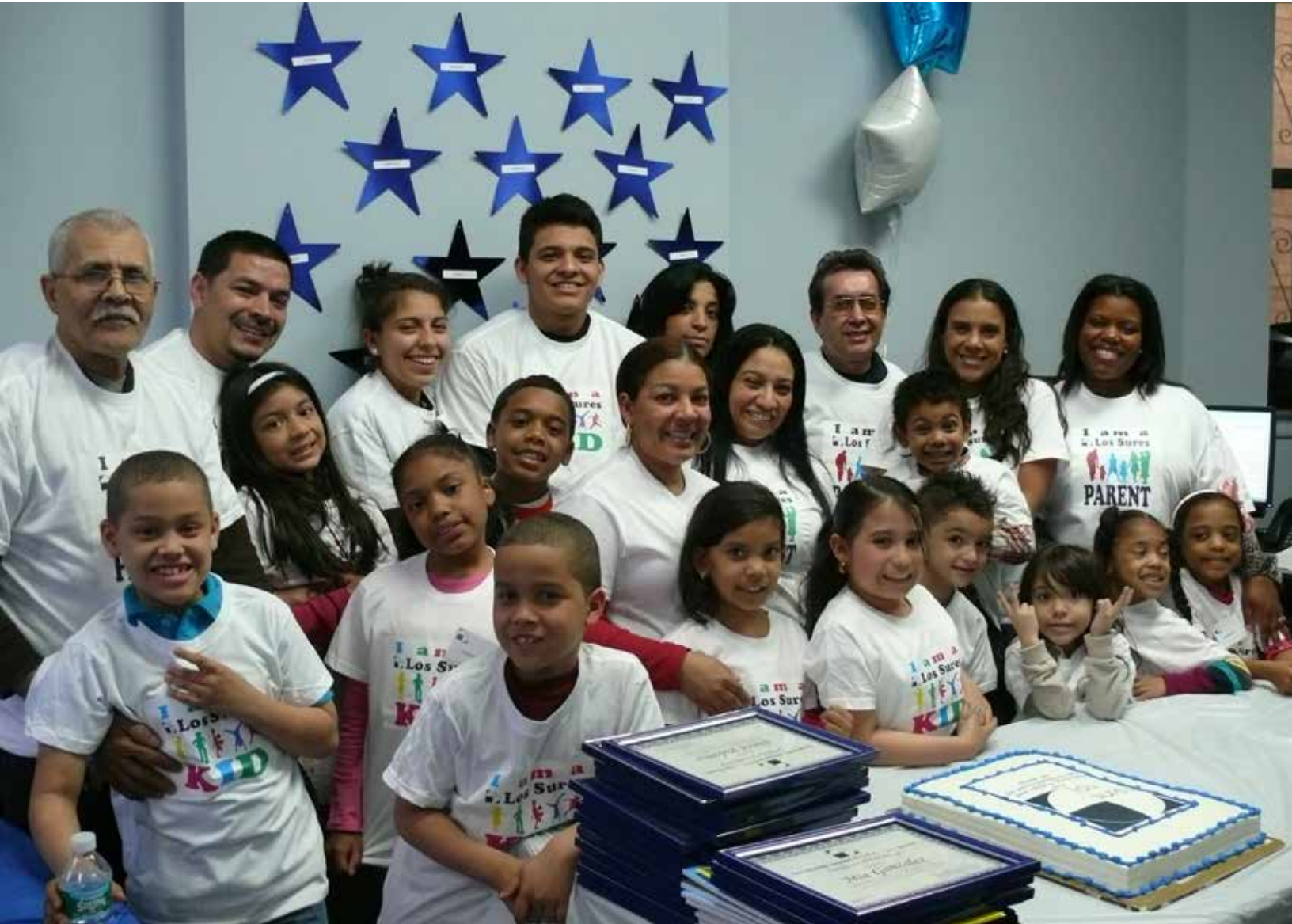
2014 Los Sures Bring Your Sons and Daughters to Work Day.