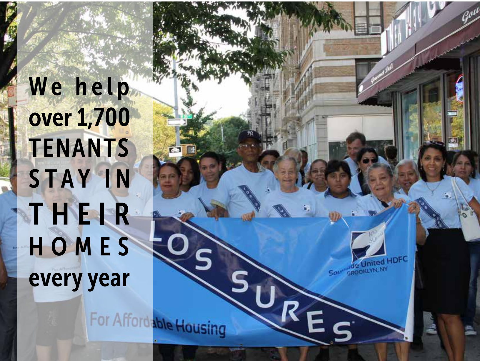
Los Sures community activists at a rally and march in 2014.

We help over 1,700 TENANTS STAY IN THEIR HOMES every year