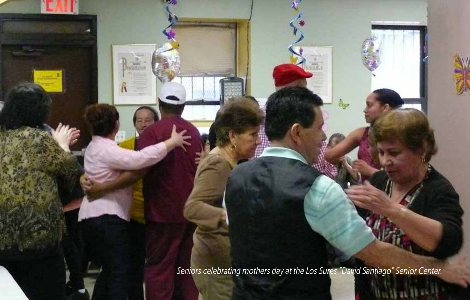
Seniors celebrating mothers day at the Los Sures "David Santiago" Senior Center.