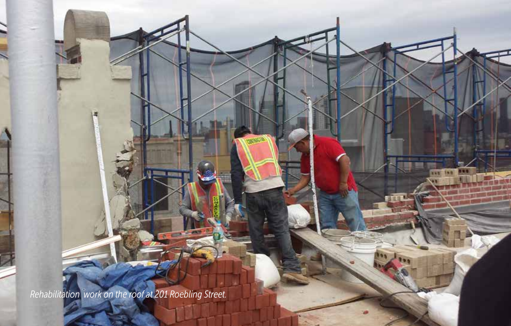
Rehabilitation work on the roof at 201 Roebling Street.