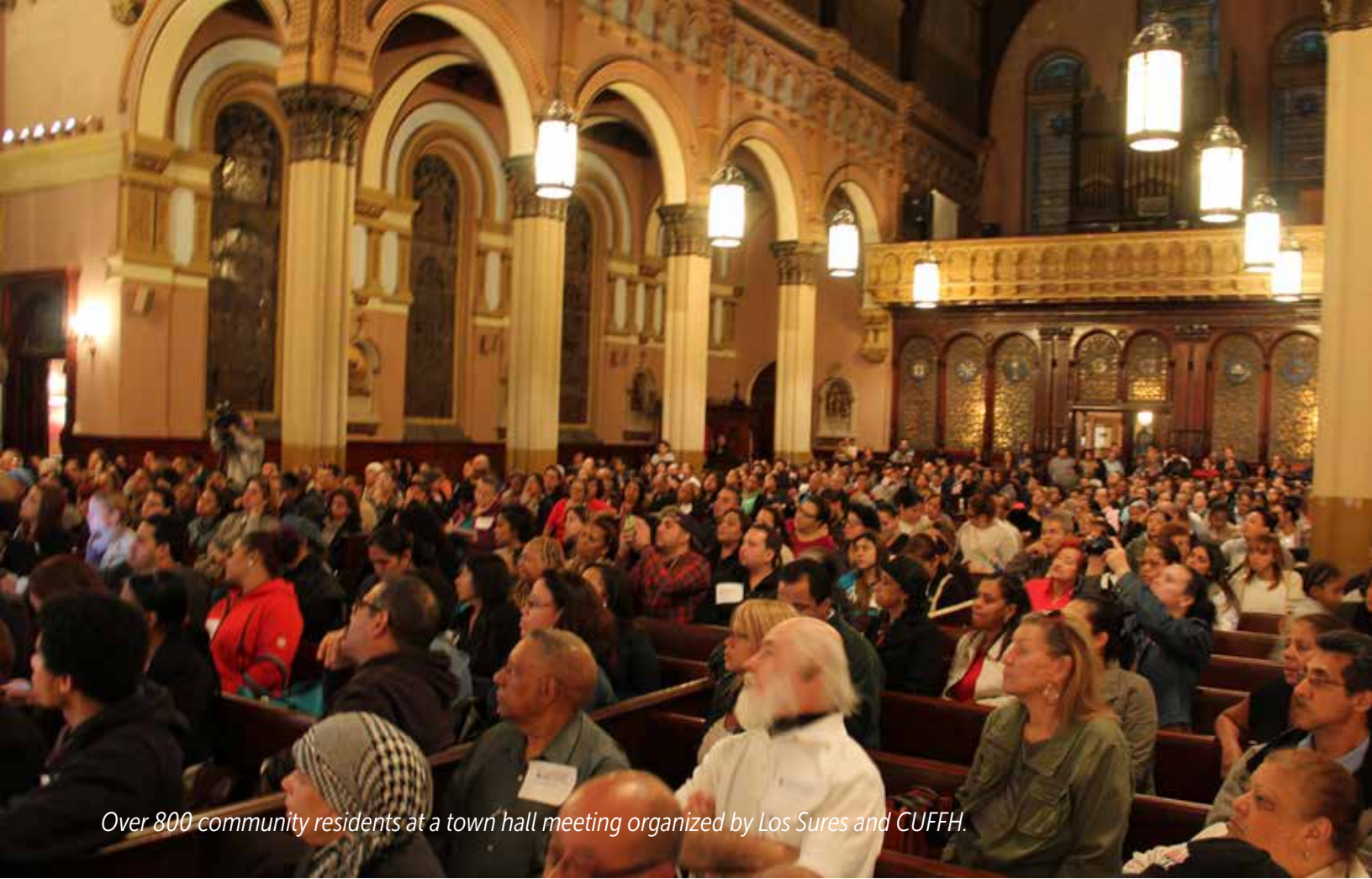
Over 800 community residents at a town hall meeting organized by Los Sures and CUFFH.