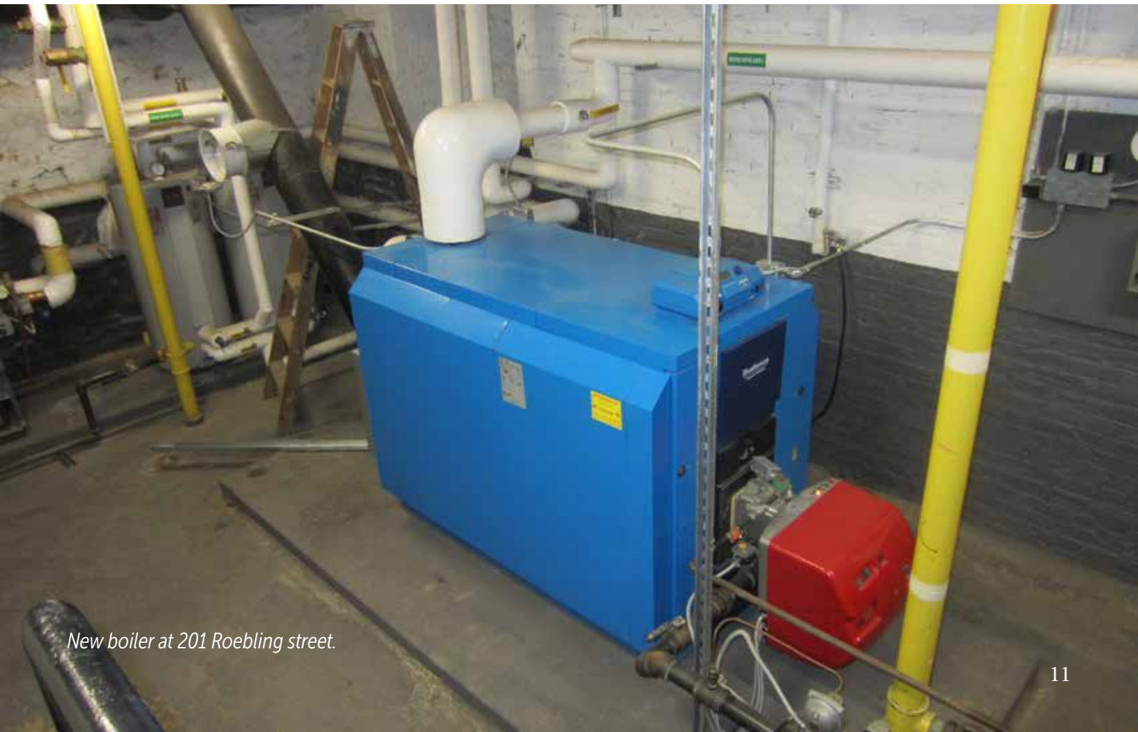
New boiler at 201 Roebling street.