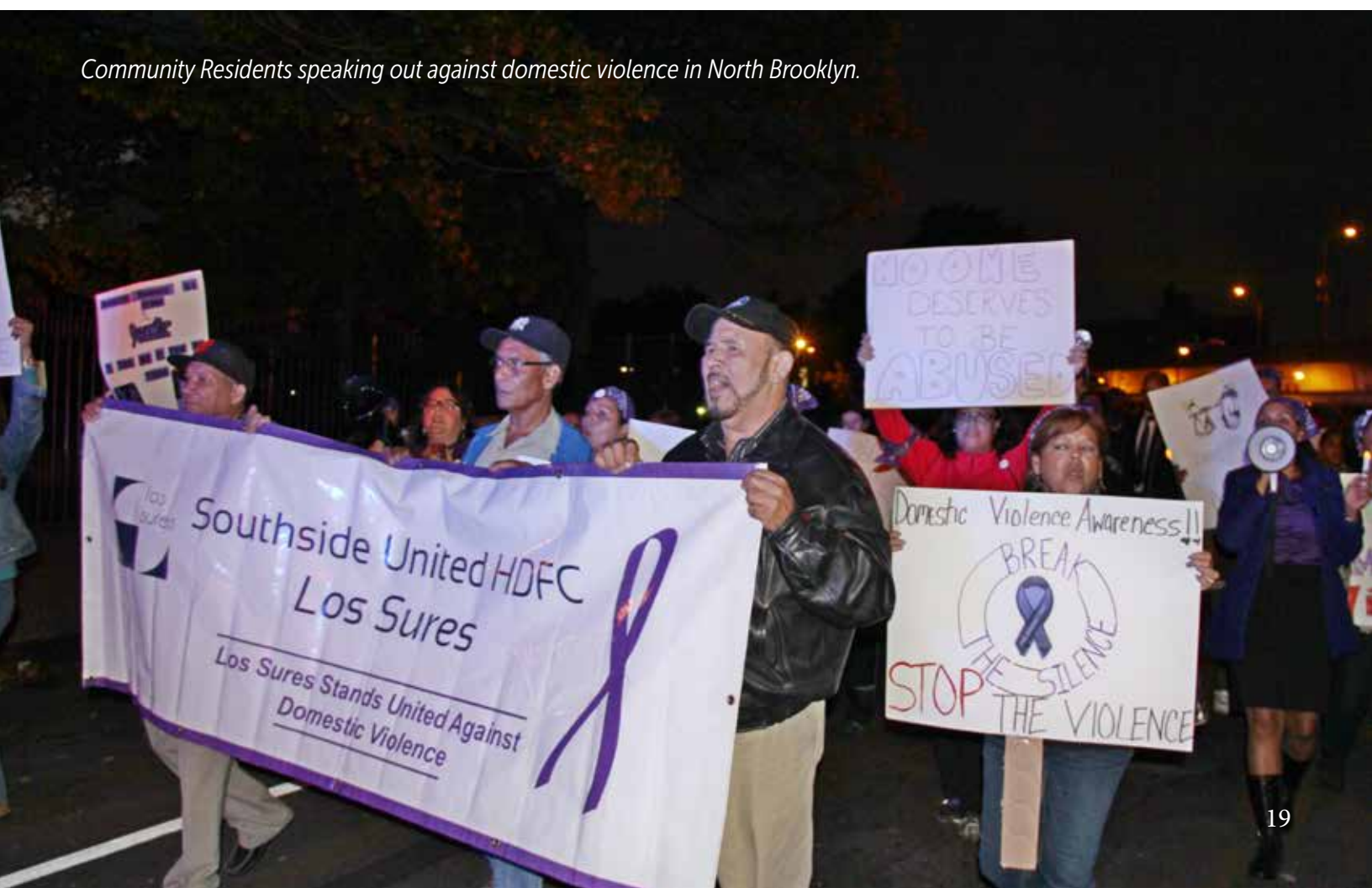
Community Residents speaking out against domestic violence in North Brooklyn.