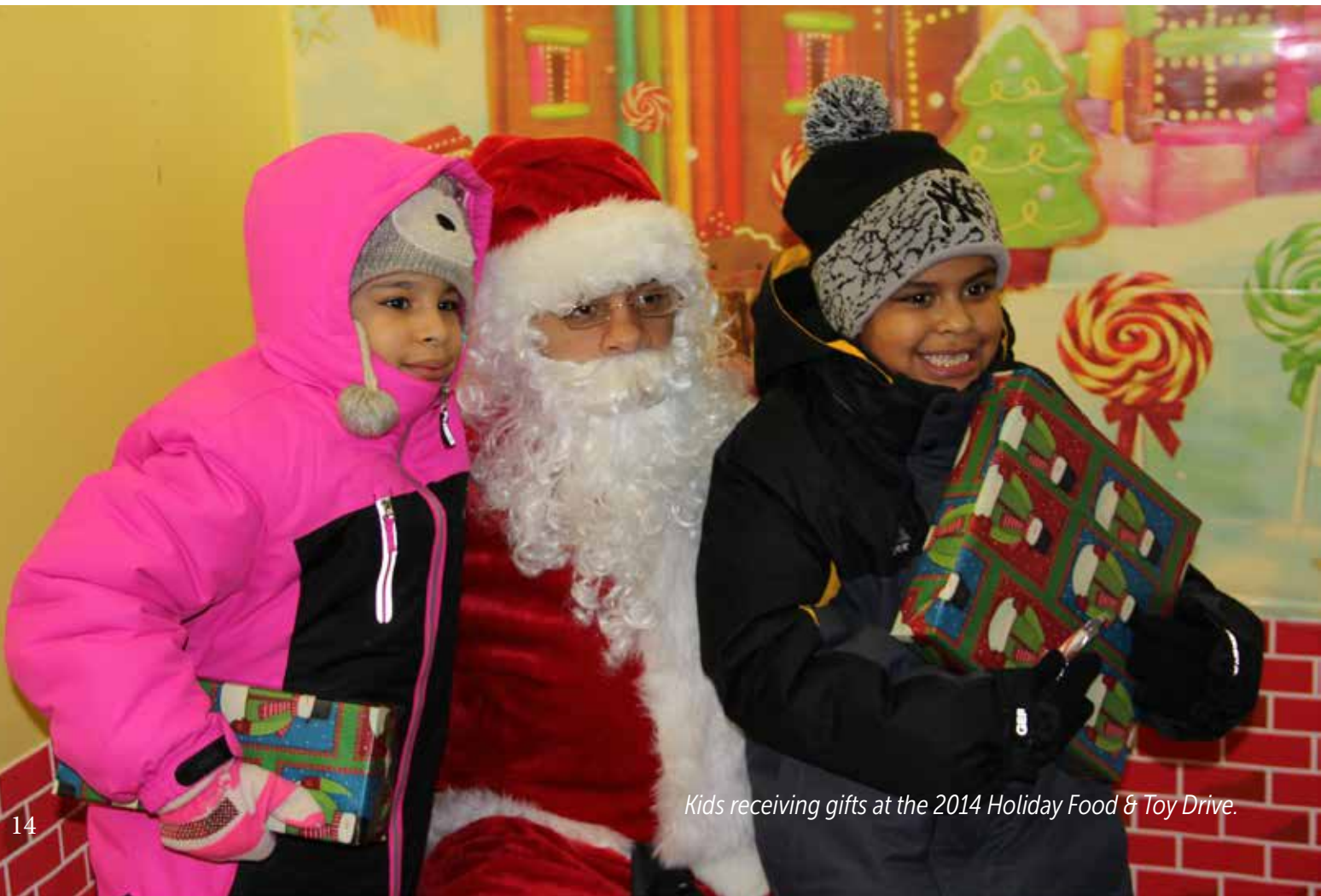
Kids receiving gifts at the 2014 Holiday Food & Toy Drive.