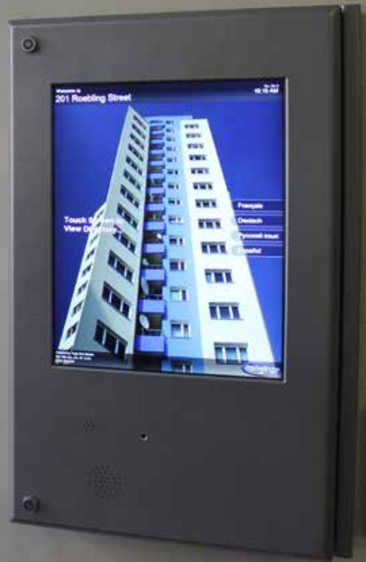
New intercom system at 201 Roebing Street.